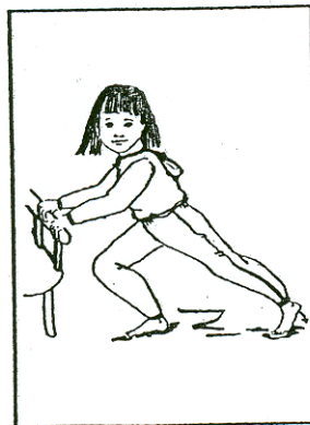
The Calf Pump