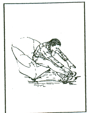
The Gravity Glider