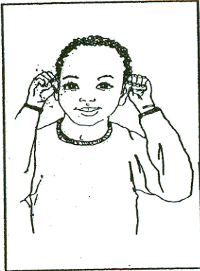
The Thinking Cap