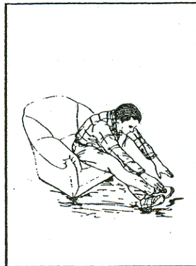
The Gravity Glider