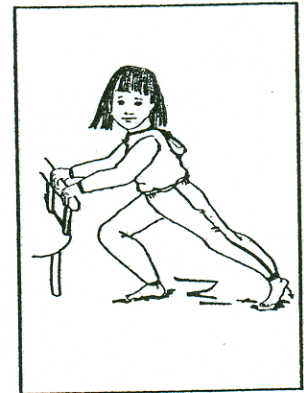
The Calf Pump