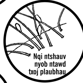
Nqi ntshauv nyob ntawd txoj plaubhau